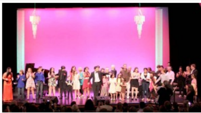
Fans join the Young Stars on stage for grand finale performance

By Community Newspapers Date posted: January 24, 2014